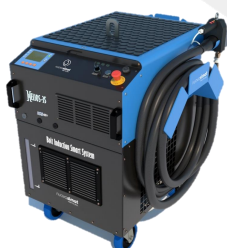
Helios-35 T Includes