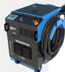
Helios-35 TR Includes

RSI* Allows to use ring – shaped inductors for the heating of male cylindrical parts (e.g. for the removal of seized nuts).